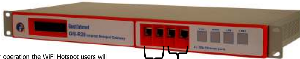
LAN1, LAN2 WAN1, WAN2 Default Port Configuration

For operation the WiFi Hotspot users will use the wireless network or kiosk computers. Connect wireless access points and kiosk computers to the gateway LAN ports.